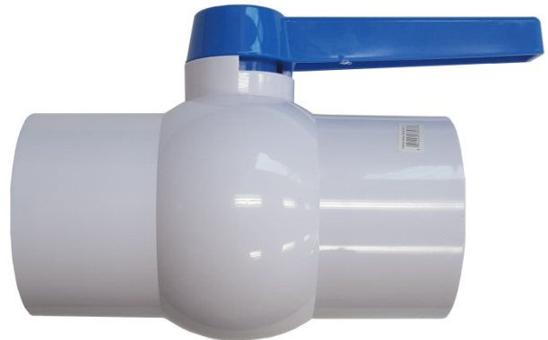
2-1/2 - 4"

461 SERIES SCH 40 MIP (MOLDED IN PLACE) COMPACT VALVE