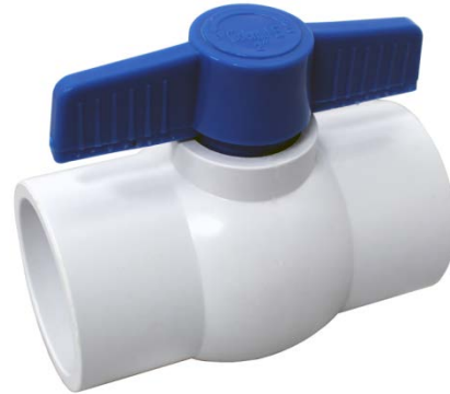
1/2 - 2"

MIP Compact Valves answer the need for an economically priced compact quarter turn ball valve for use in irrigation, pool/spa, and commercial plumbing applications. Available in 1/2 - 4" sizes