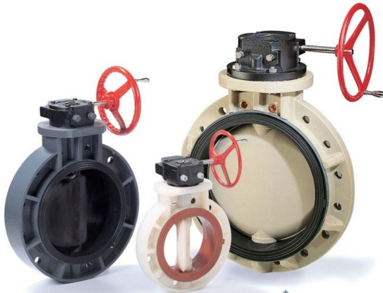
411NG Series (See separate submittal for this series.)

Butterfly valves shall be gear actuated. Valve body and disc shall be produced of beige Polypropylene material. Valve boot/seal and O-rings shall be made of EPDM material. Shaft shall be made of stainless steel. The disc bore (center) shall contain a integrally molded stainless steel reinforcement square liner, which engages with the stainless steel valve shaft. Boot/seal (liner) and disc shall be the only wetted parts of the valve. Gear operator housing and handwheel shall be coated cast iron, with stainless steel fasteners and handwheel stem. Bolt pattern shall conform to ANSI/ASME B 16.5 Class 150 standard.